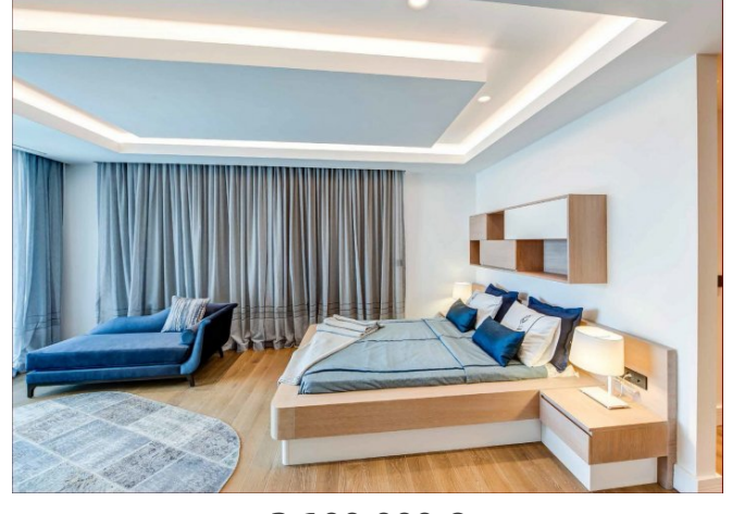
553 m<sup>2</sup>, 6 + 1 For Sale, Villa