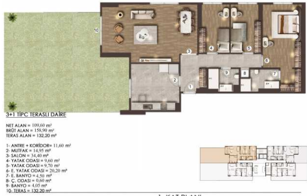
1. KAT PLANI